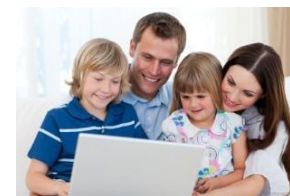
Home Users > 17k