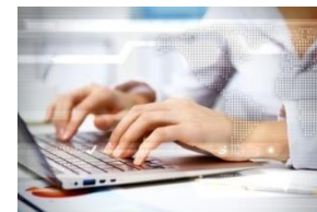
Business Customers - 700