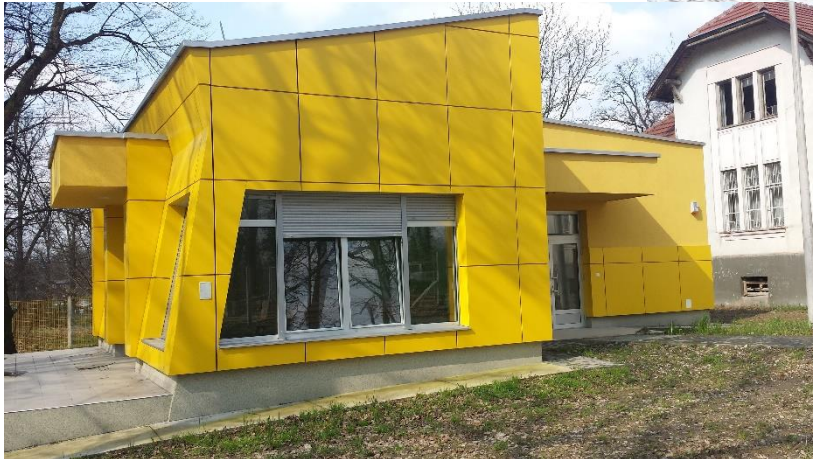
Newly constructed building