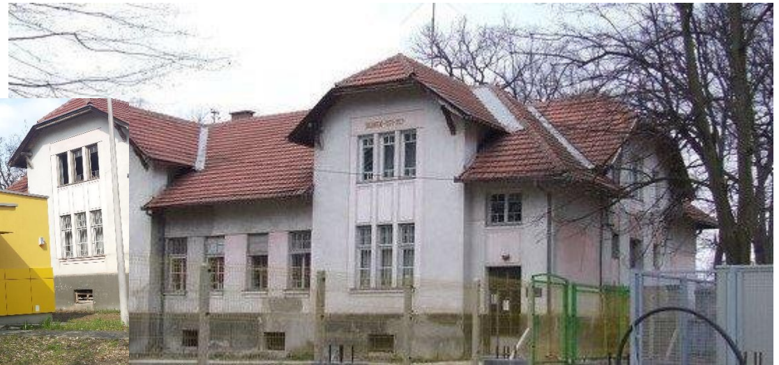
Building to be reconstructed