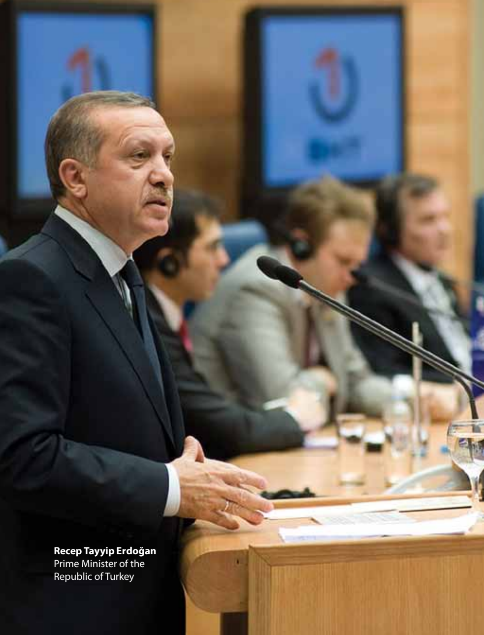
Recep Tayyip Erdoğan Prime Minister of the Republic of Turkey