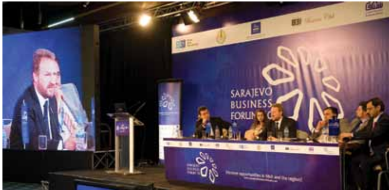
Bakir Izetbegovic, Member of the Presidency of B&H